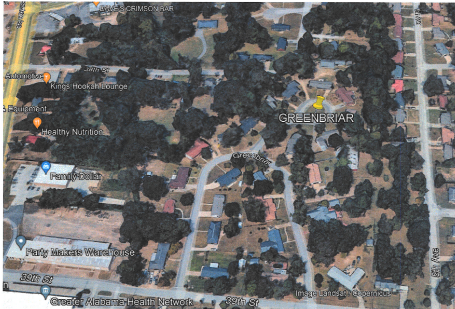
Attachment No 1 10. Greengriar Traffic Circle