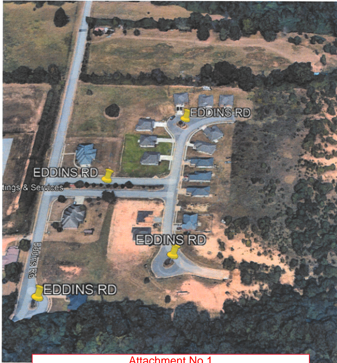
Attachment No 1 8. Eddins Rd Hacienda Circles