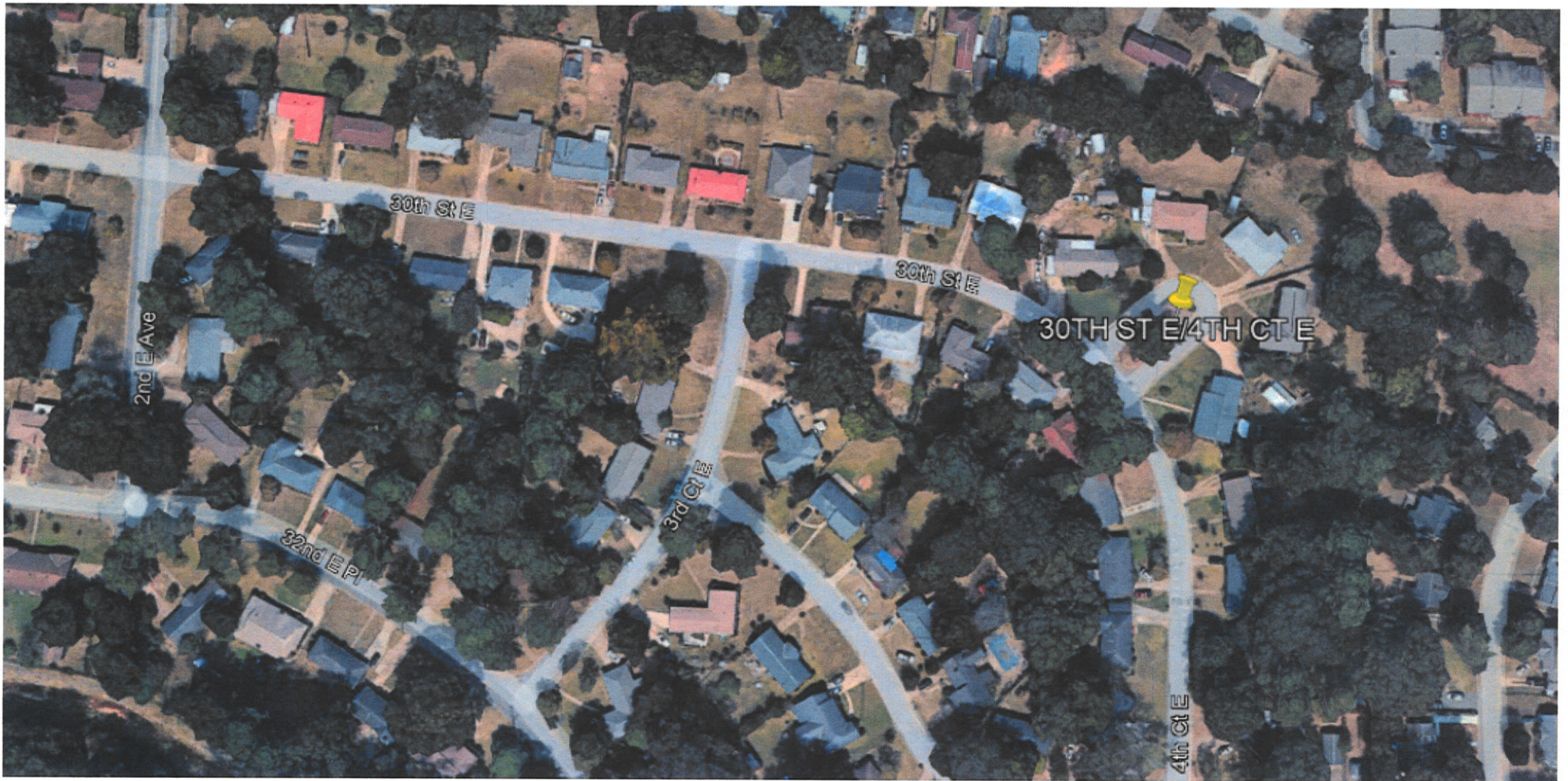
Attachment No 1 3. 30th / 4th Ct E Traffic Circle