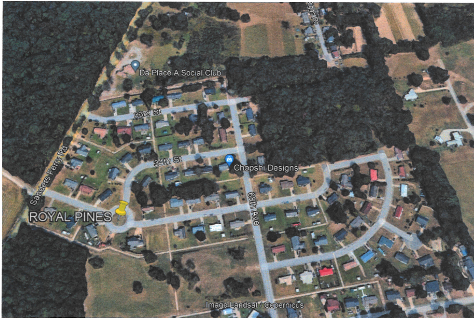
Attachment No 1 16. Royal Pines Traffic Circle