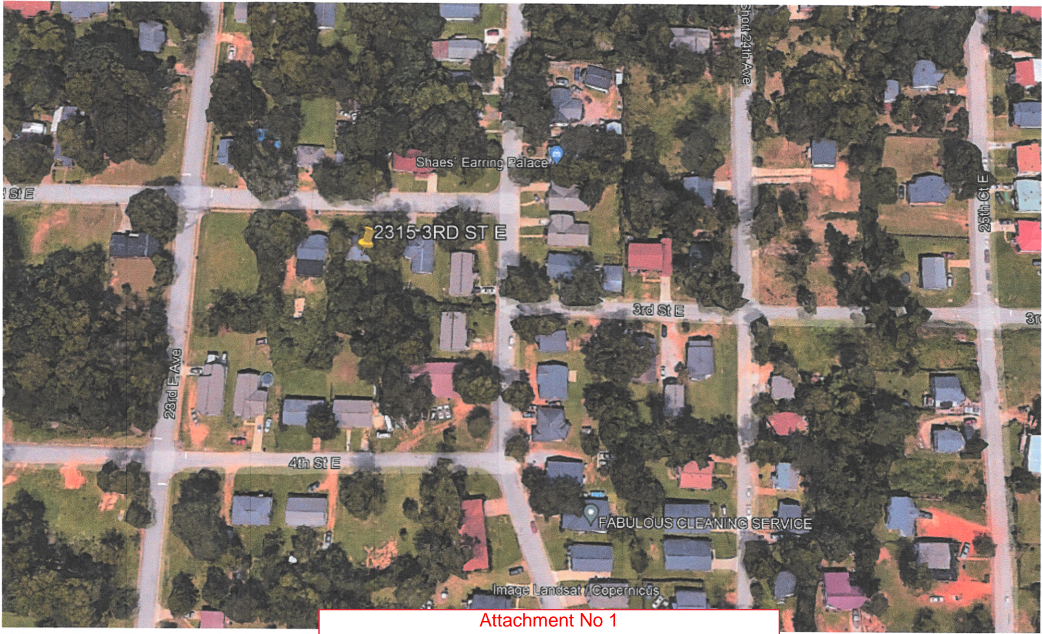
Attachment No 1 23. 2315 3rd Street E