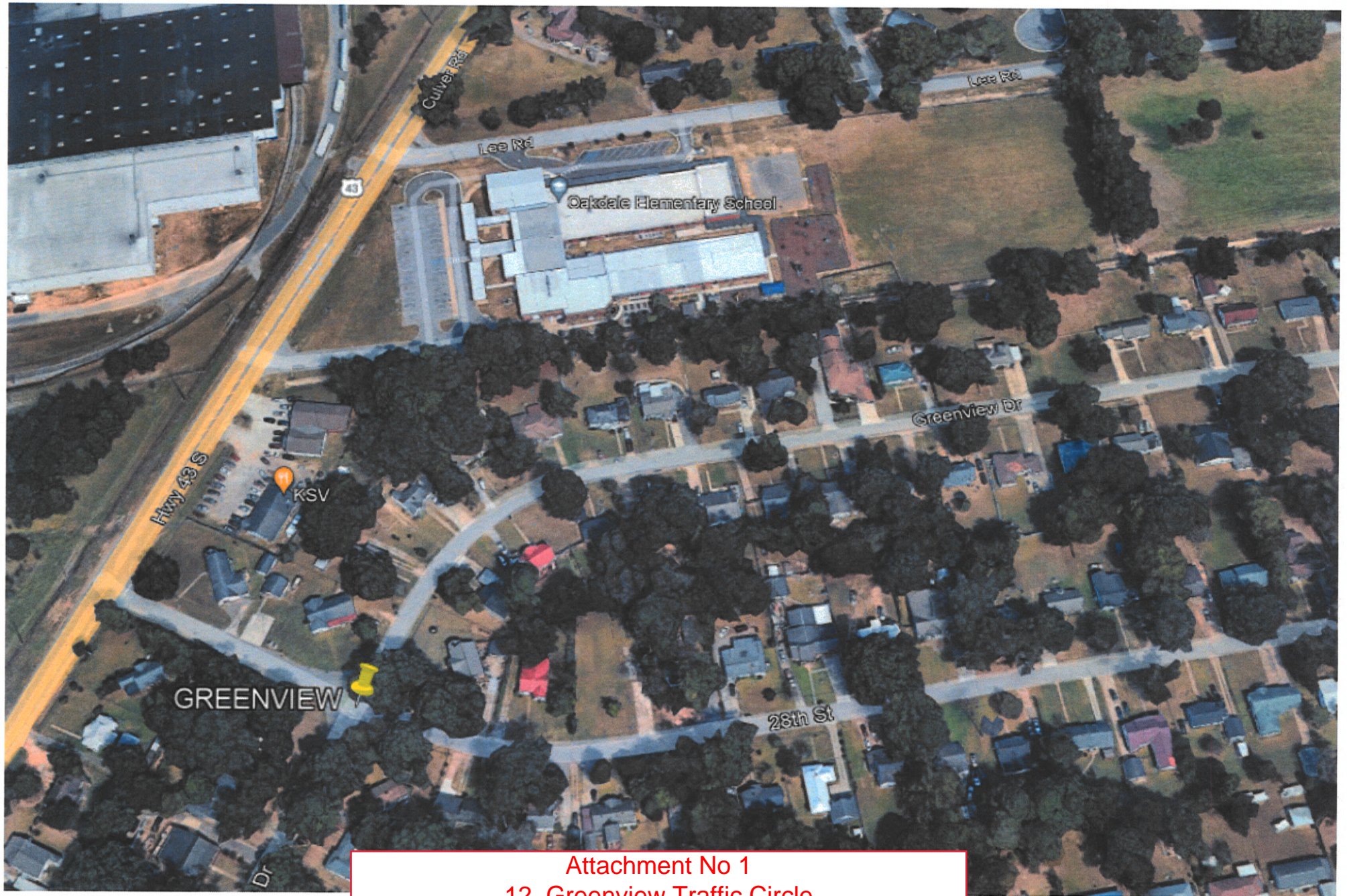
Attachment No 1 12. Greenview Traffic Circle