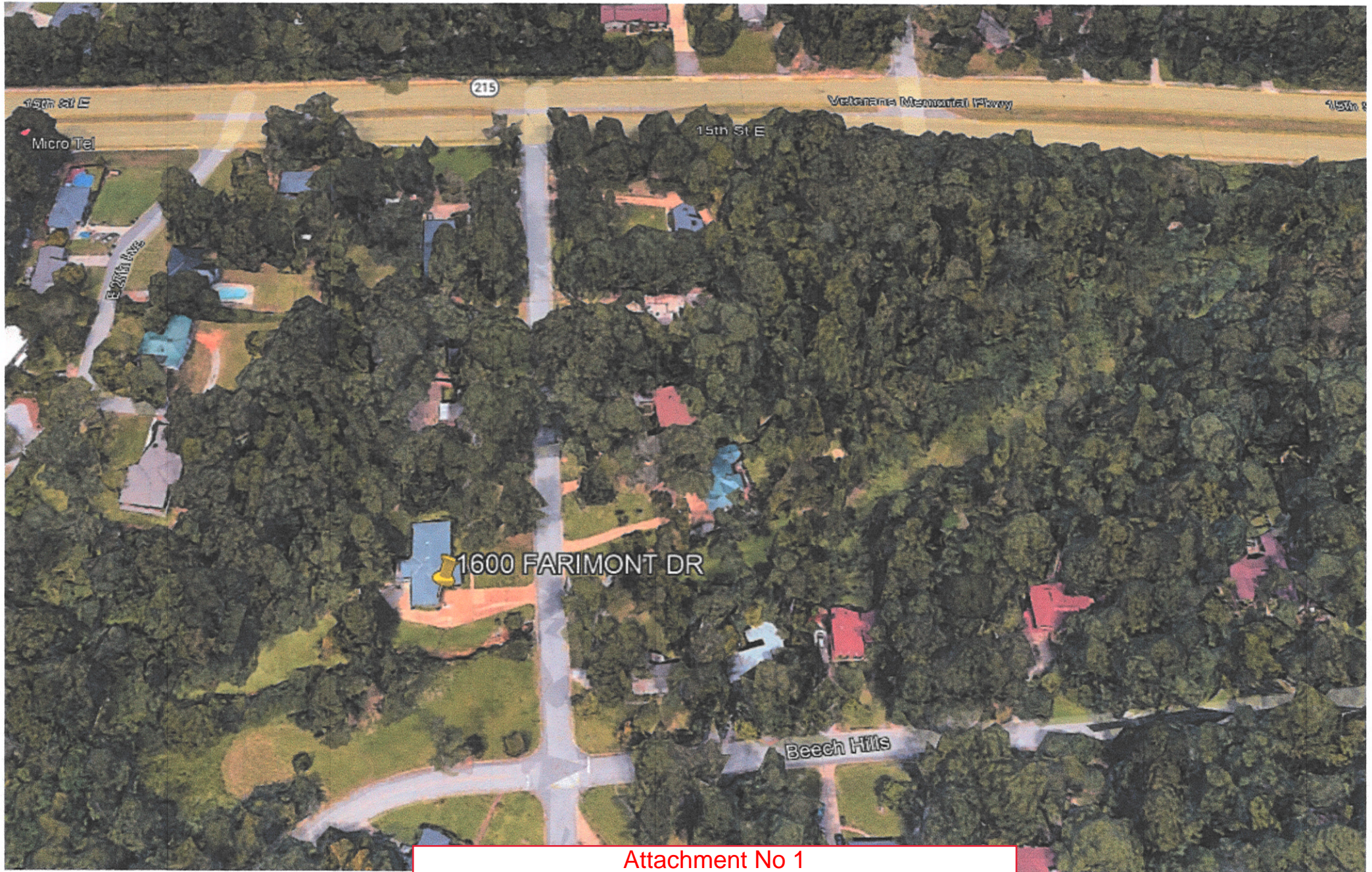
Attachment No 1 22. 1600 Fairmont Dr