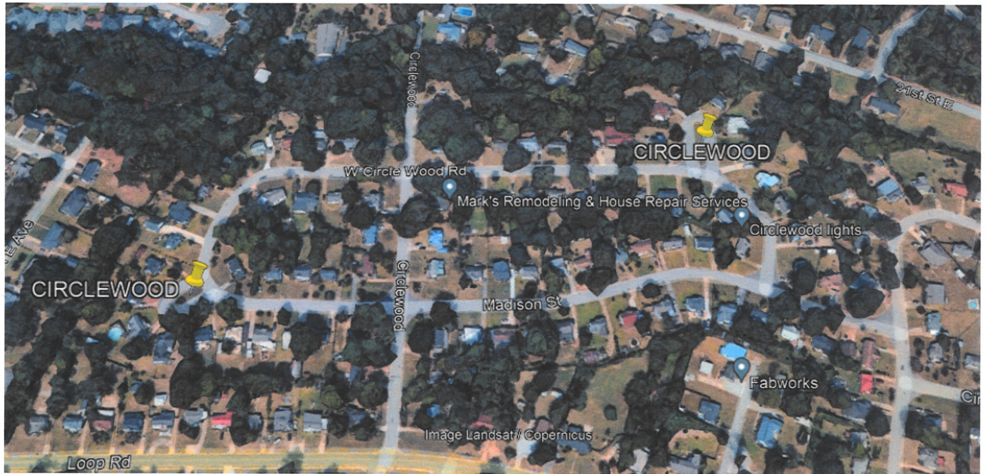
Attachment No 1 5. Circlewood Traffic Circles