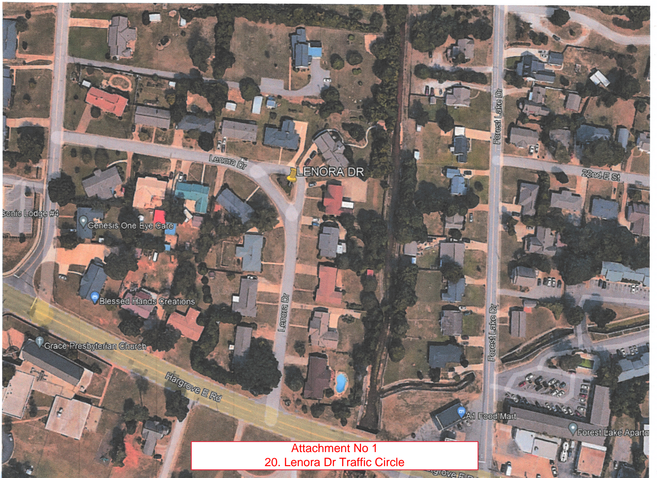
Attachment No 1 20. Lenora Dr Traffic Circle