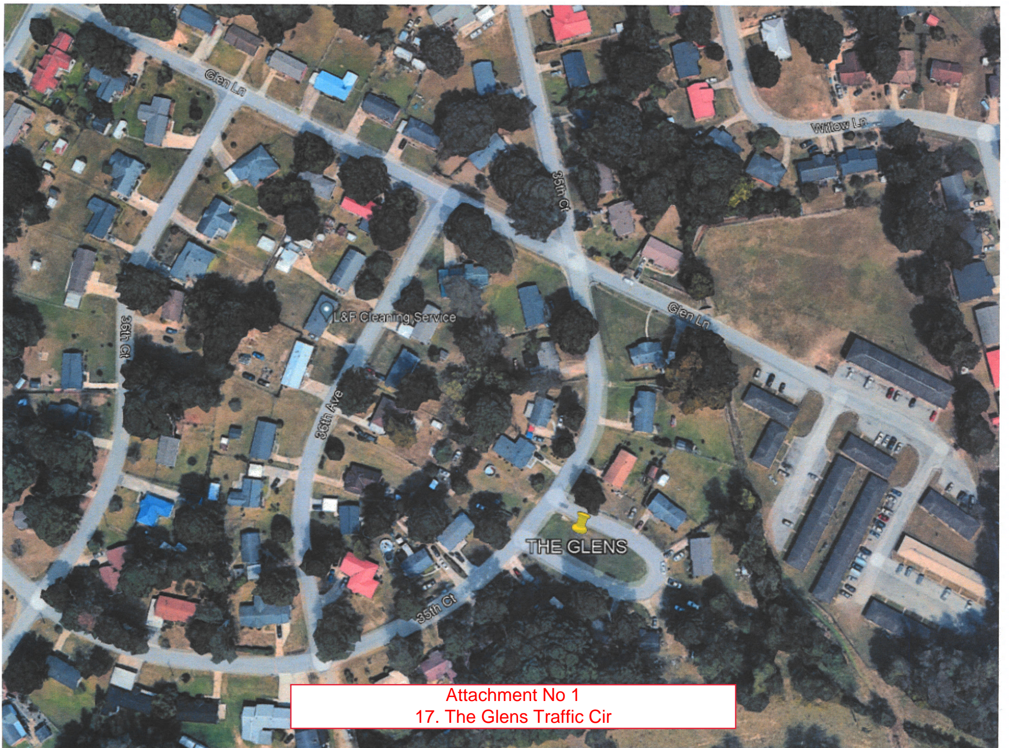
Attachment No 1 17. The Glens Traffic Cir