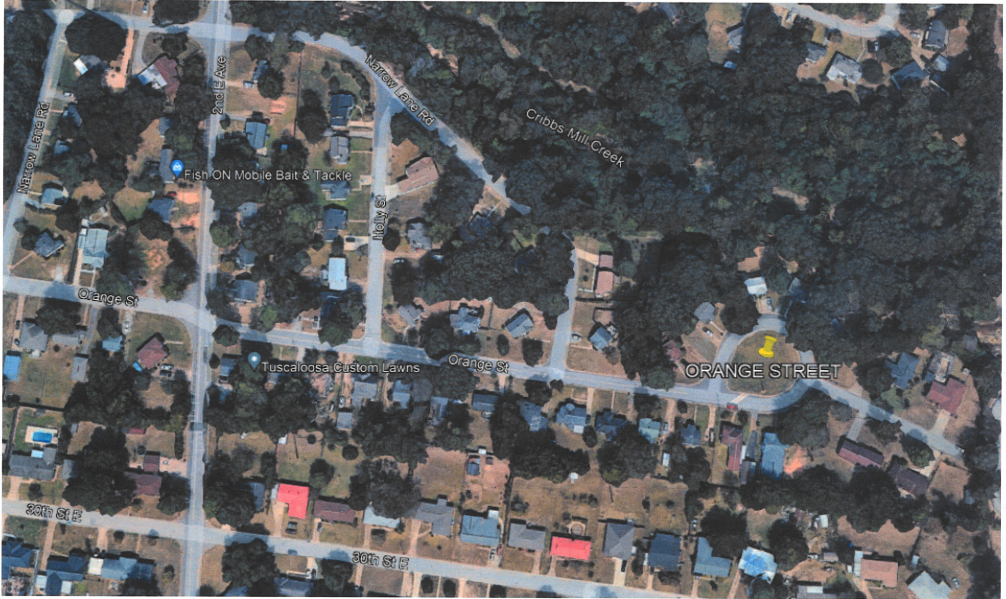
Attachment No 1 15. Orange Street Traffic Street