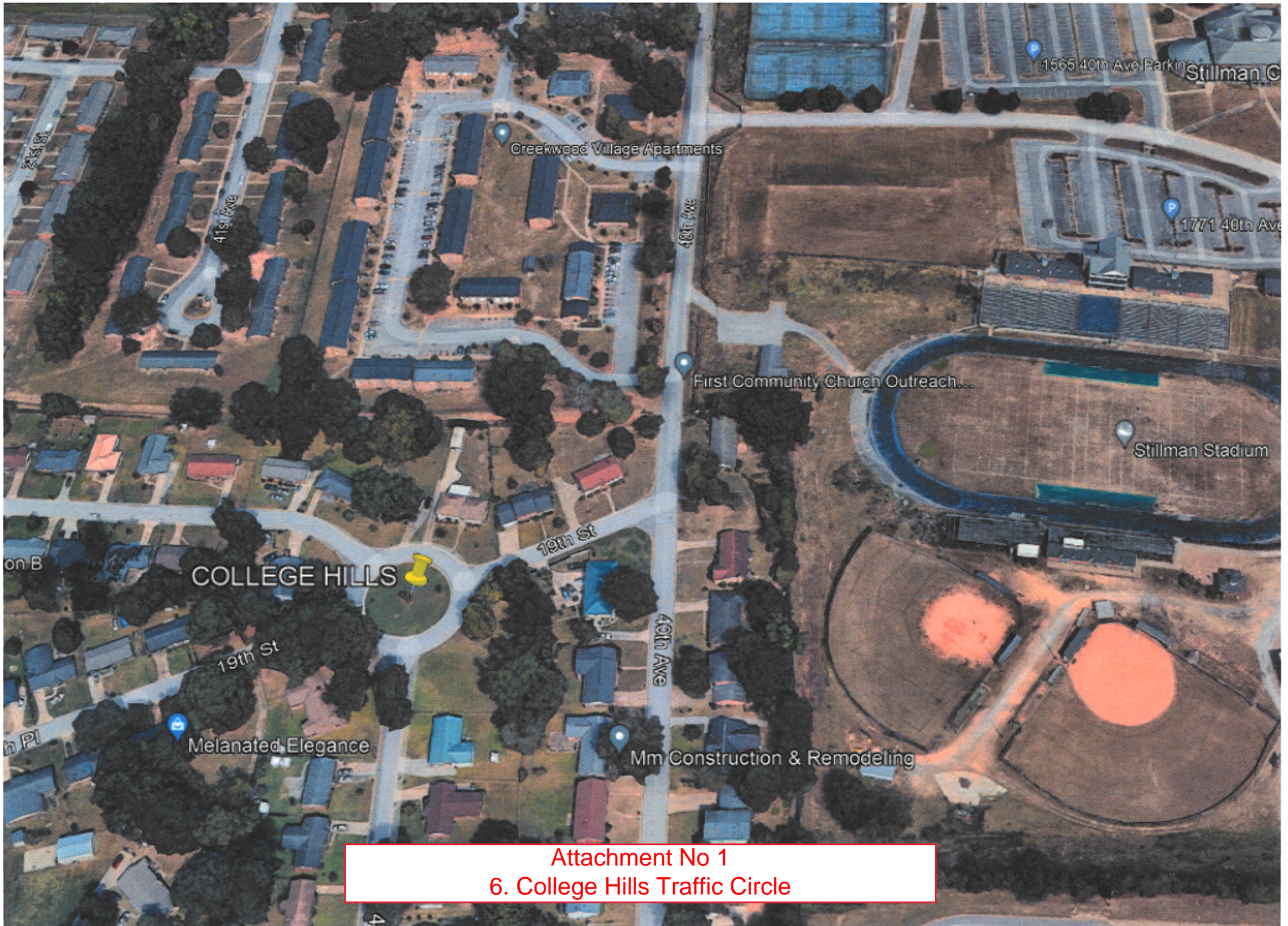
Attachment No 1 6. College Hills Traffic Circle