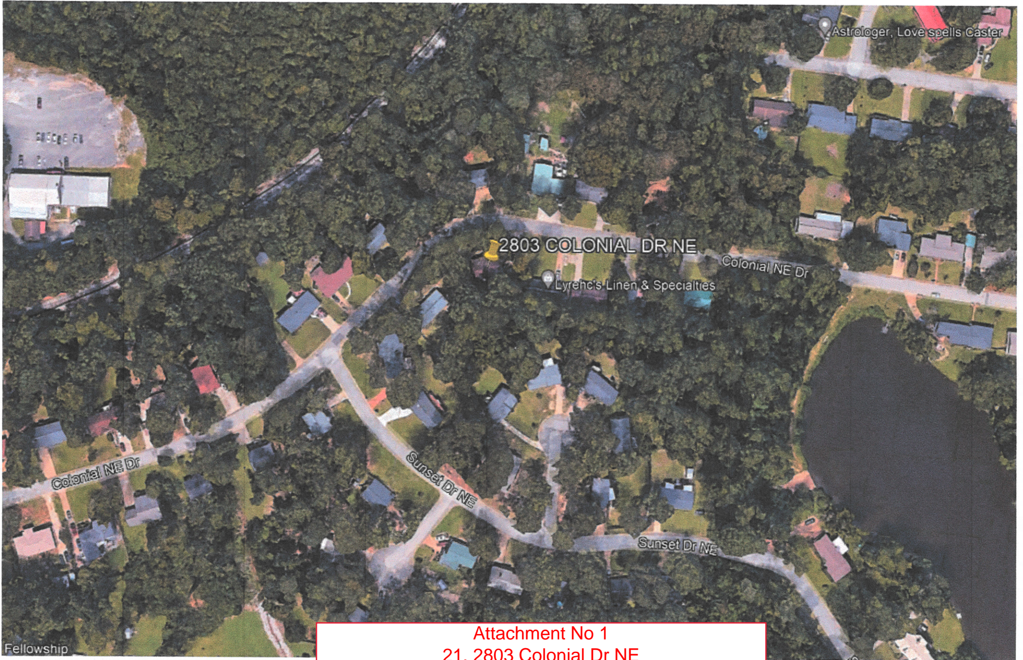
Attachment No 1 21. 2803 Colonial Dr NE