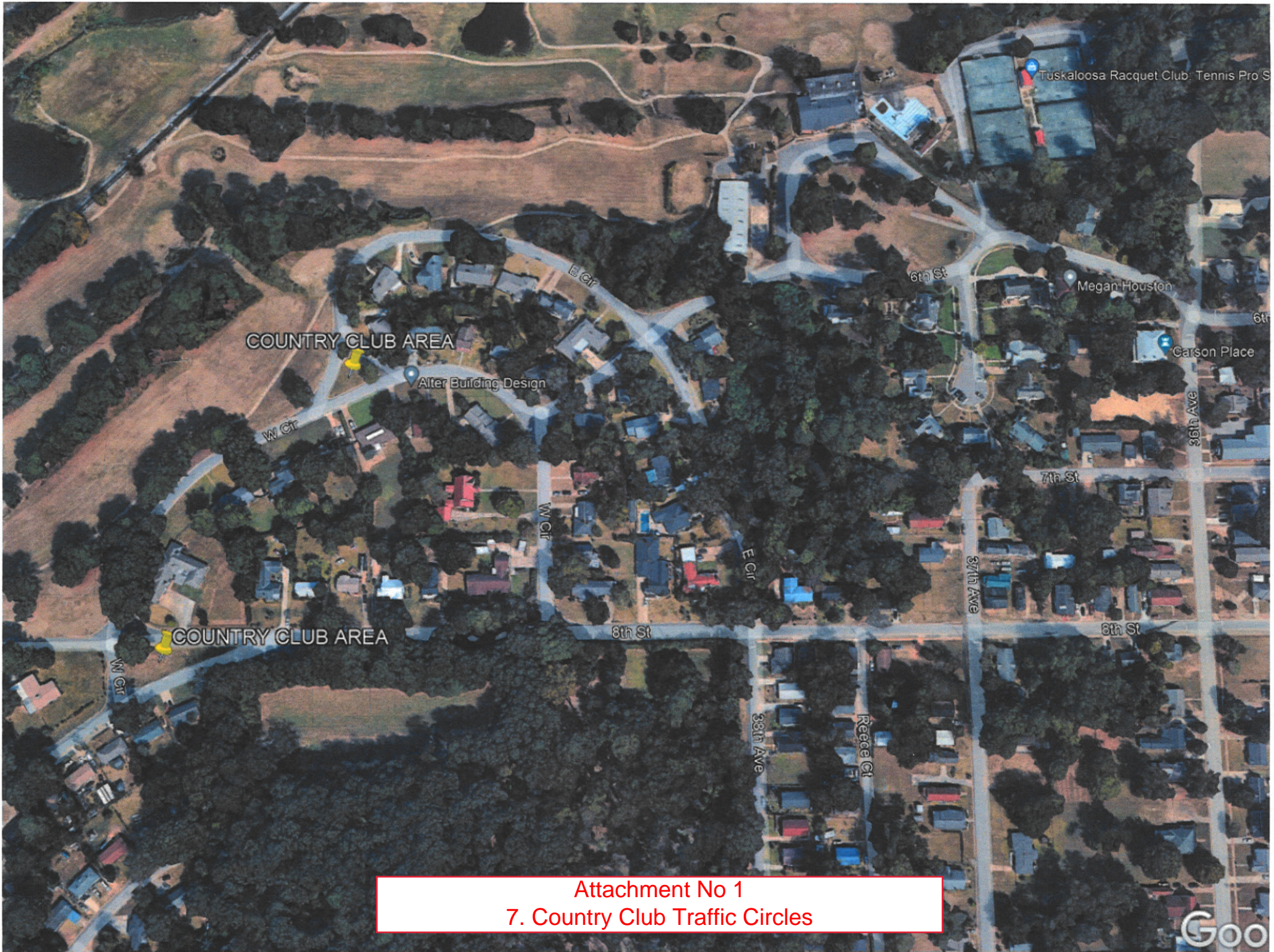
Attachment No 1 7. Country Club Traffic Circles