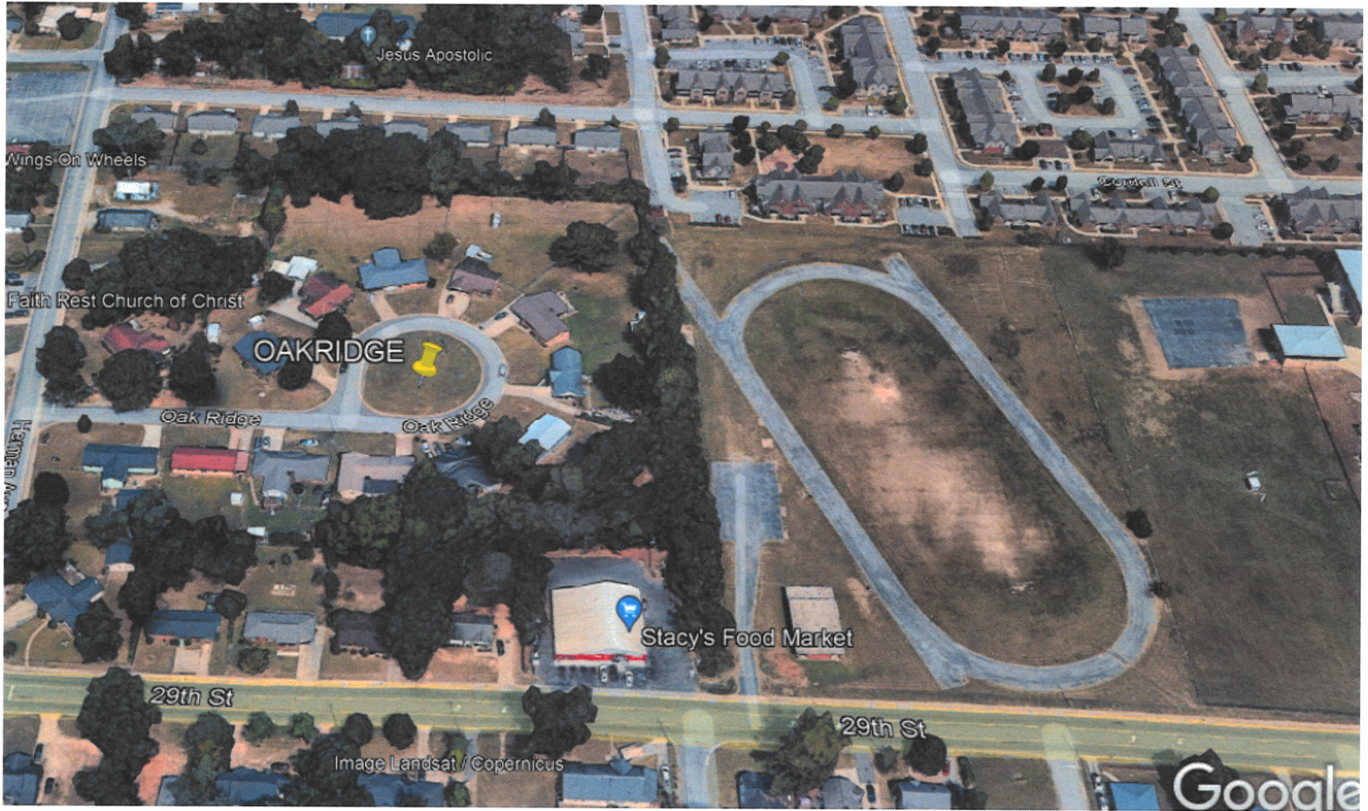
Attachment No 1 13. Oakridge Traffic Circle