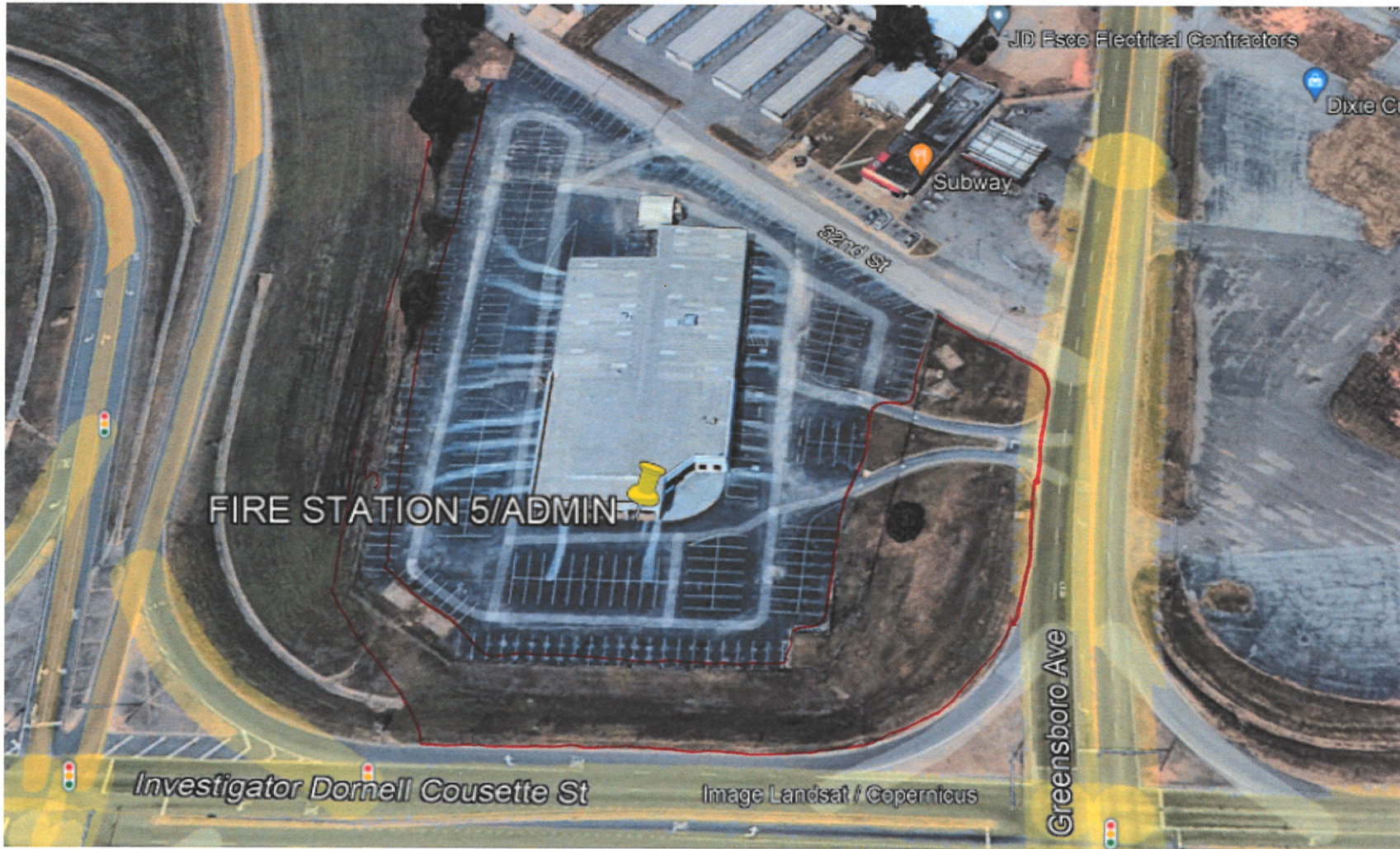
Attachment No 1 9. Fire Station 5/Admin